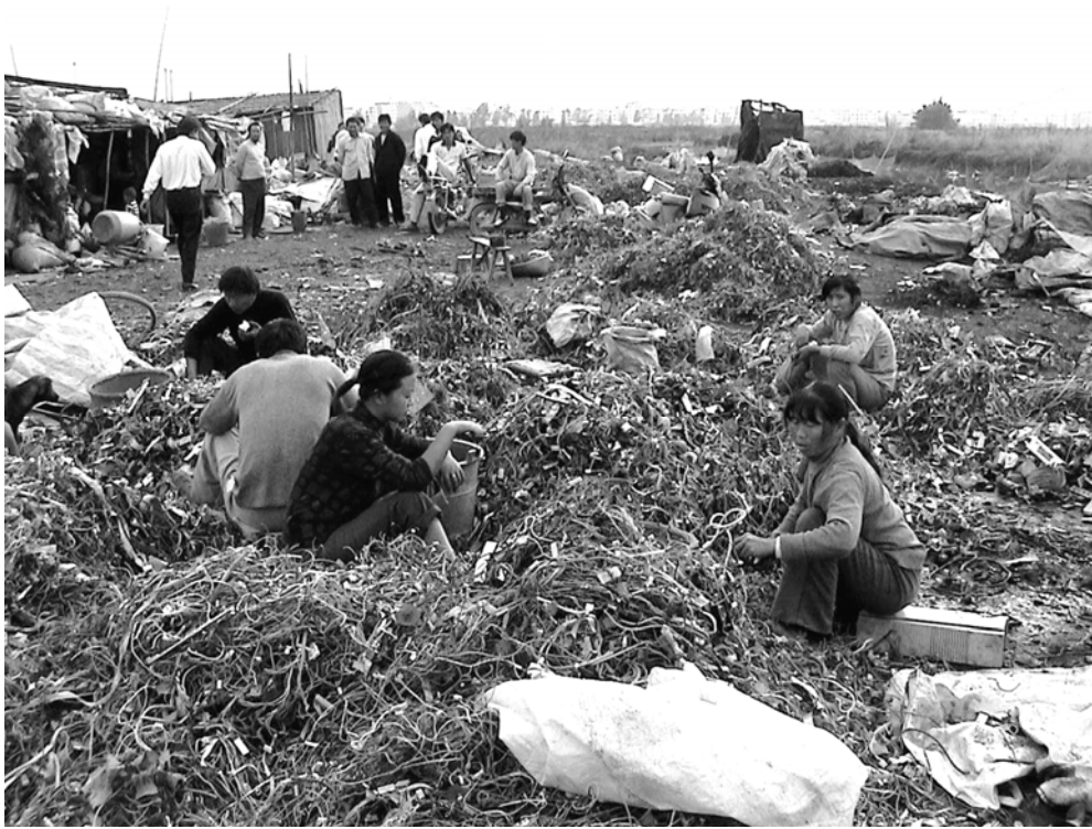
Fig. 4. Stripping Computer Wires in South China