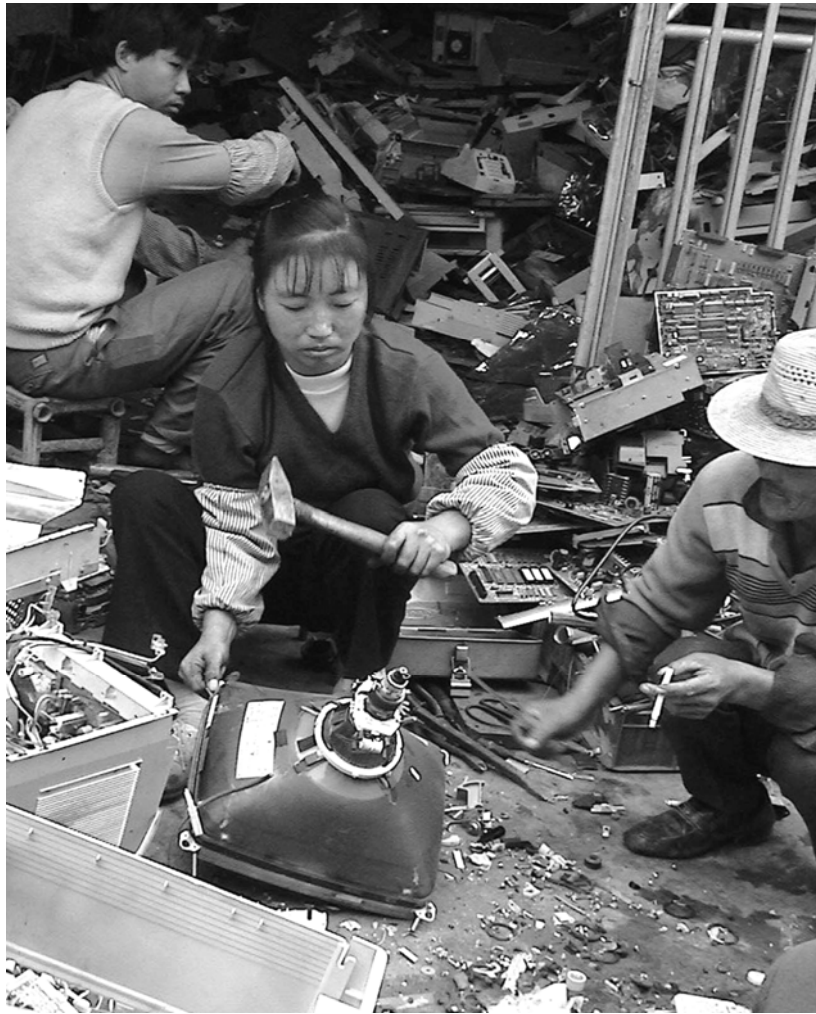
Fig. 3. Dismantling computers in South China