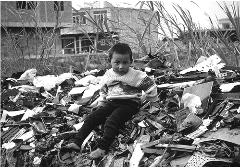
Fig. 2. Child on e-waste in South China